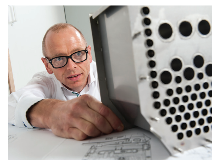
That's ATAG – boilers you can trust from people you can trust.

When the i-Series range of boilers launched in the UK in 2015 we put a lifetime replacement guarantee on the iCon heat exchanger, yet we were confident and wanted to do more. In August 2017 we introduced a 10 year warranty on parts and labour across our entire range of boilers. We did this because we believe that choosing an ATAG boiler should be a long term investment for both of us - we hope you agree.